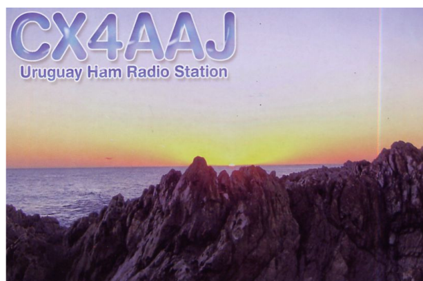
QSL card recently received by G3WZK

Editor's note: I have been using PSK31 (and some PSK63) at G3WZK for about 2 years, during which I have enjoyed making about 450 QSOs with a total of 53 countries on all bands from 160m to 6m. My latest new PSK country was Uruguay in April this year on 28 MHz – and I have the QSL card to prove it – see below. I thoroughly recommend this mode. Ten metres has been good lately, too!