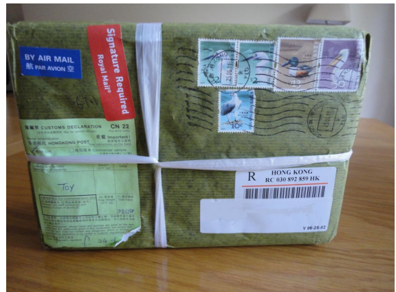
The package arrives!

"This was my first ever eBay purchase although I already had a PayPal account. After selecting a seller, I made the transaction and waited for it to arrive. On the 24th June I received an email saying that it had been despatched and on 30th June it arrived, not bad considering it came from Hong Kong!