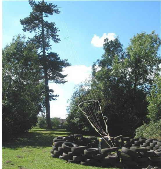
A Radio Susy AM Antenna

Earthing often consists of ten or so one metre copper pipes driven into the ground: this proves surprisingly effective particularly when the site was on clay rather than chalk and flints. Such antennas are tuned very sharply to the intended frequency of operation with multiple parallel wires to increase bandwidth and capacitance to earth.